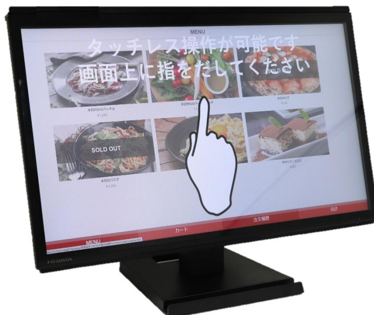
Fig.1 AirInput™ Panel 15.6-Inch Wide X-Y Type demo set

Alps Alpine's AirInput™ Panel addresses these issues as a new input method making use of the space directly in front of the panel for no-touch operation, thereby improving the work or operating environment.